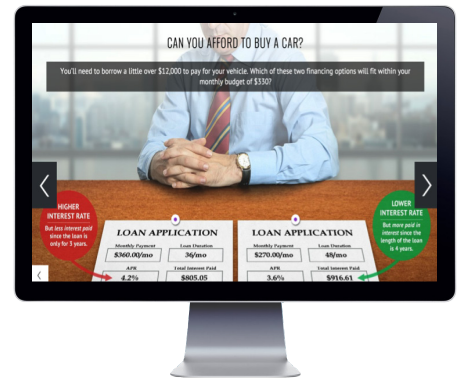
Evaluate Which Car Loan Fits In Your Budget