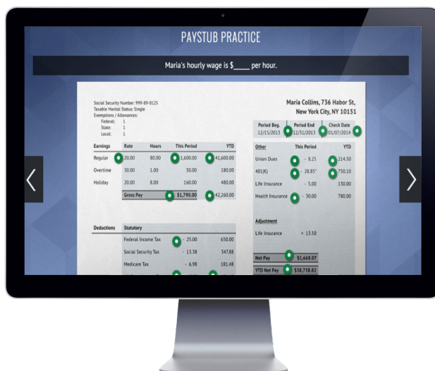
Exploring The Components Of A Paystub

Can You Afford To Buy A Car? - That brand new sports car may be calling your name, but there are a lot of things to consider before buying your first car. Students pick a car to buy, and see whether it will push their budget to the limit.