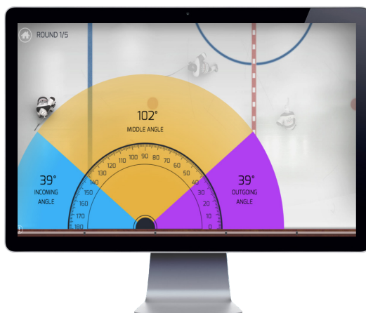
Understanding Angles To Complete A Bank Pass

Geometric Constructions On Ice - Geometry exists everywhere, even on a hockey rink. In this module, students must use their understanding of geometry and the coordinate plane to correctly place the points, line segments, and circles on the hockey rink.