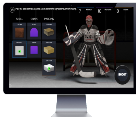
Optimizing Material for Goalie Leg Pads Criteria