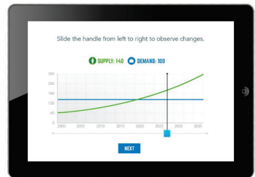
Supply and Demand Interactive Slider