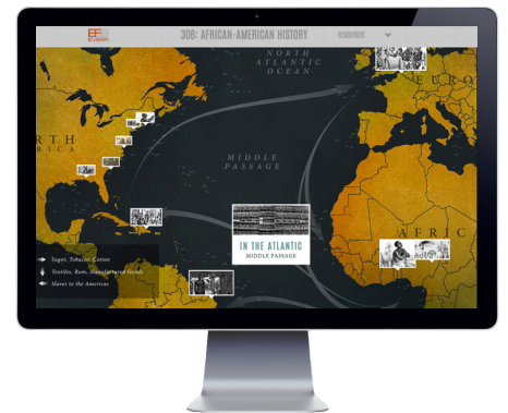
Trans-Atlantic Slave Trade Interactive Map