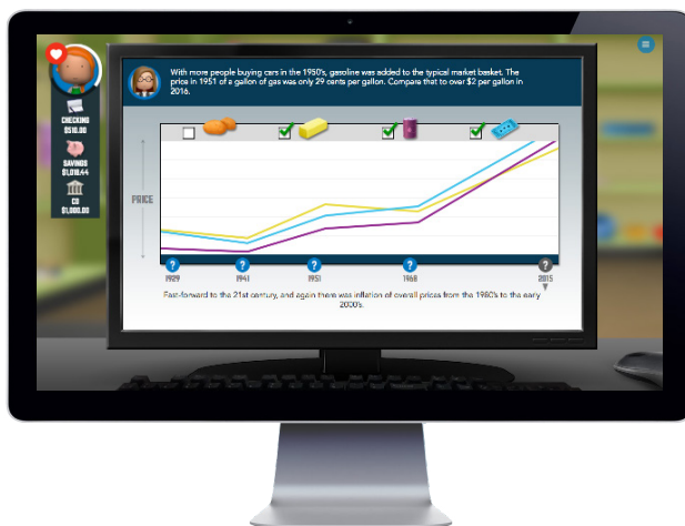
Interactive Graph of Inflation Over Time

Growing a Business - There is no greater investment than the one you make in yourself. This is a lesson that should be learned early and often. For every student that feels the pressure to find a path after high school, this activity is a necessary release valve. In this activity, students learn about the many opportunities that exist beyond high school, from trade school to four year institutions.