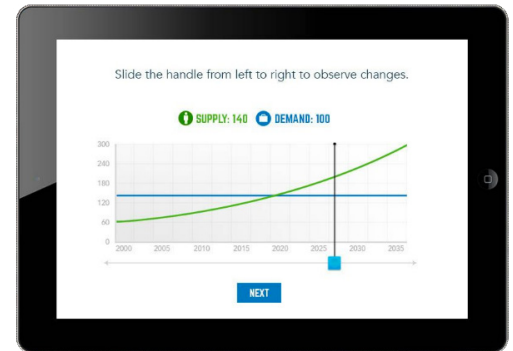
Supply and Demand Interactive Slider