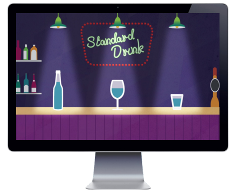
Learning the Meaning of a Standard Drink