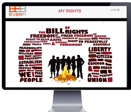
My Rights activity

As a final capstone activity, students take what they've learned from the course to write an op-ed piece on a topic of their choice. From outline to conclusion, students are guided through the composition and revision of a thoughtful, persuasive essay.