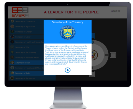
Getting to Know the Cabinet Activity