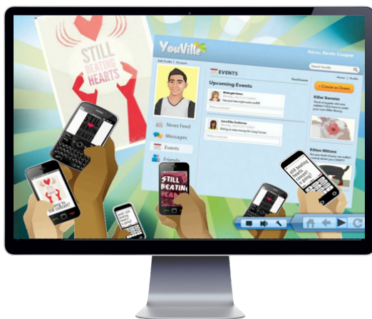
My Digital Life: Interactive Game

My Digital Life: Gaming Simulation - The most memorable learning experiences are the fun ones. That's no exception here, where everything comes together with a final interactive game. In this simulation, students demonstrate their mastery of digital issues – creating a blog, managing a social networking site, solving technology problems, and working to resolve a cyberbullying situation.