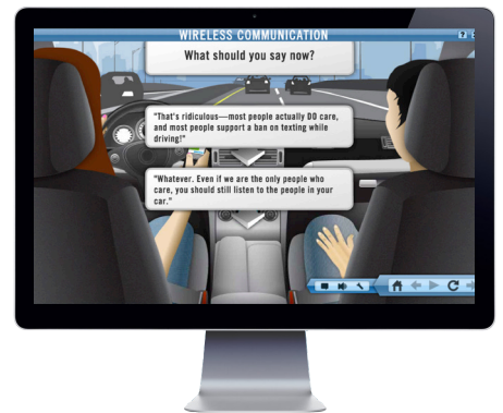
Wireless Communication Activity