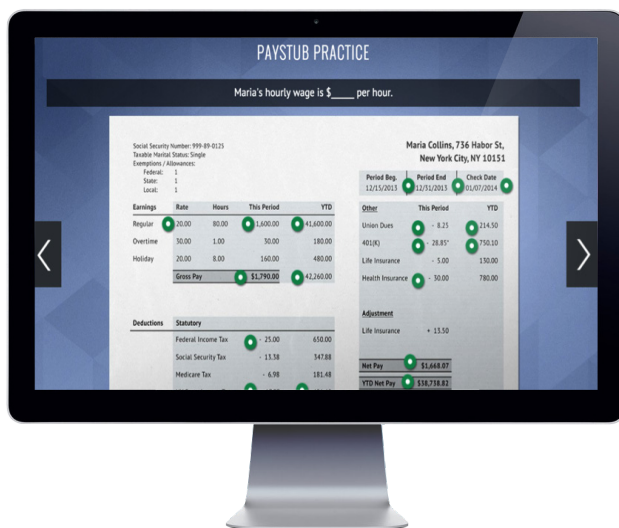
Exploring The Components Of A Paystub

Can You Afford To Buy A Car? - That brand new sports car may be calling your name, but there are a lot of things to consider before buying your first car. Students pick a car to buy, and see whether it will push their budget to the limit.