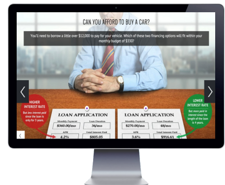
Evaluate Which Car Loan Fits In Your Budget