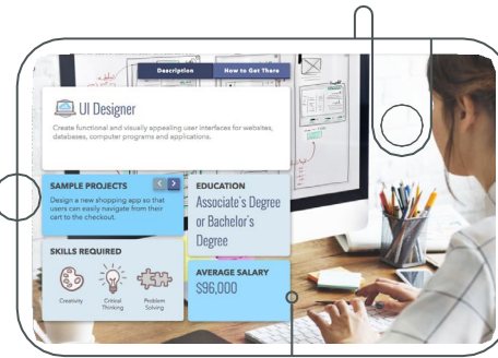
Endeavor - STEM Career Exploration