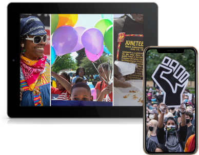
306: Continuing the Story is Mobile-Friendly

Standards Alignment: C3 Social Studies Standards, Common Core State Standards in English Language Arts and College and Career Readiness