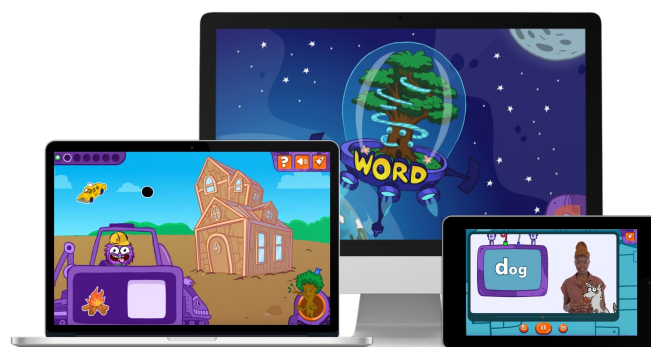
WORD Force: An Early Literacy Adventure

WORD Force games and resources incorporate practice in skills promoted by the science of reading: phonemic awareness, phonics, vocabulary, reading fluency, and reading comprehension. The embedded instructional support and developmental scope and sequence in WORD Force align with how children learn literacy skills best: through explicit, systematic instruction. 1