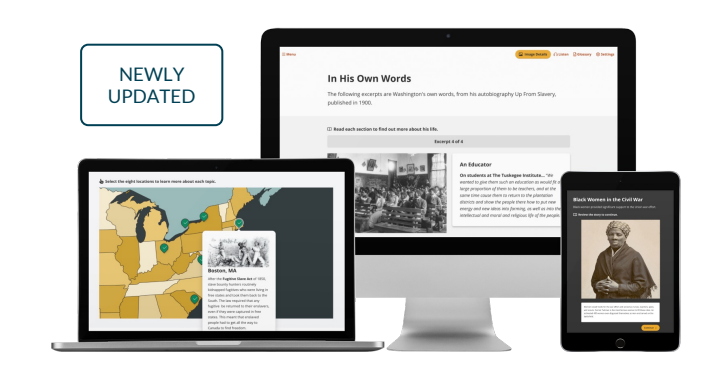
306: Black History

306: Black History is a newly updated, free digital course exploring the lives, stories, and lessons of Black Americans throughout history. The course brings history to life for students through immersive learning content that goes beyond just the facts of history, bringing out the themes, narratives, and geographic concepts that provide important context and frameworks for students to analyze historical events. The lessons are followed by a capstone project that challenges students to carefully consider their connections to Black History and use research to support their perspectives.